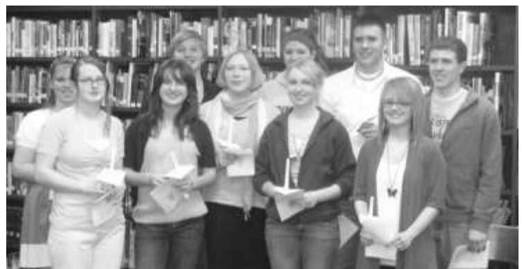
NHS Spring 2011 Inductees